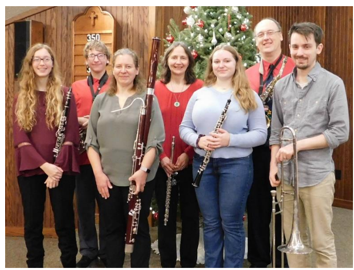
Instrumentalists enhance the Christmas Day service.